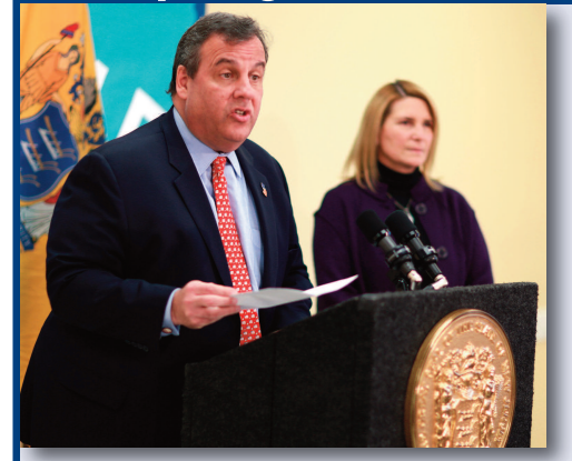
Governor Christie announced that the Department of Health is seeking proposals to add up to 864 adult inpatient psychiatric beds during a visit to Renaissance House in Newark on Jan. 31.