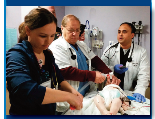
During the exercise, three teams were challenged with managing a critically ill infant during three, 20-minute scenarios.