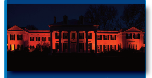
Drumthwacket, Governor Christie's official residence in Princeton, illuminated in red to recognize National Wear Red Day and the Go Red movement.